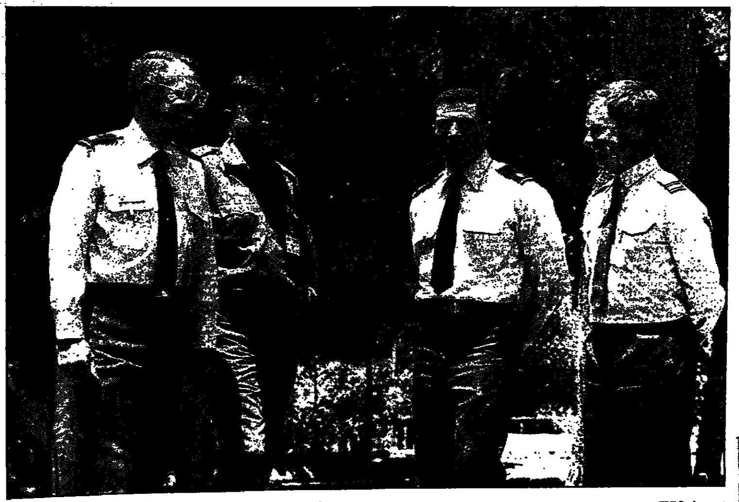
Foreign officers at an IDF course on army liaison